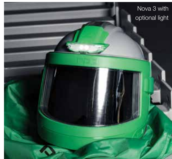
Nova 3 with optional light

The Nova 3 is also easily repairable and maintainable in the field with all parts easily replaceable with many parts being replaceable without tools! The only tool you'll need is a single hex key which is stored inside the helmet. Even the inner padding can be removed and is machine washable.